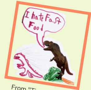
From "Tippy Time"