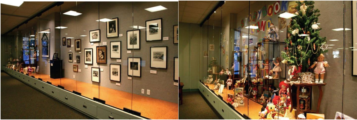
Examples of exhibits showing off photographs and a lively exhibit by the Prescott Doll Club. The holiday tree is about four feet tall.